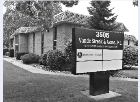
New ICC USA headquarters located in Kalamazoo, Michigan

You can reach the new ICC office by calling (269) 382-9960 or toll free at 800-722-4453. The new office is located at 3506 Lovers Lane, Suite 8, Kalamazoo, Michigan 49001.